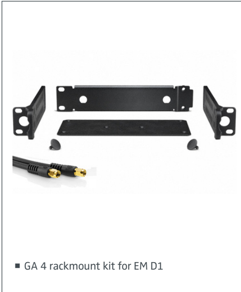
■ GA 4 rackmount kit for EM D1

The EM D1 is a 1/2 19" digital wireless receiver for HD Live Sound. Its clear and intuitive OLED display offers a self-explanatory menu structure for easy handling and quick set-up operating in a license-free 2.4 GHz band. Its automatic channel management and self-configuration of several receivers in parallel operation eliminates the need for manual settings. EM D1 comes in rugged, stage-proof metal housing, with 2 antennas, power supply and a rackmount kit.